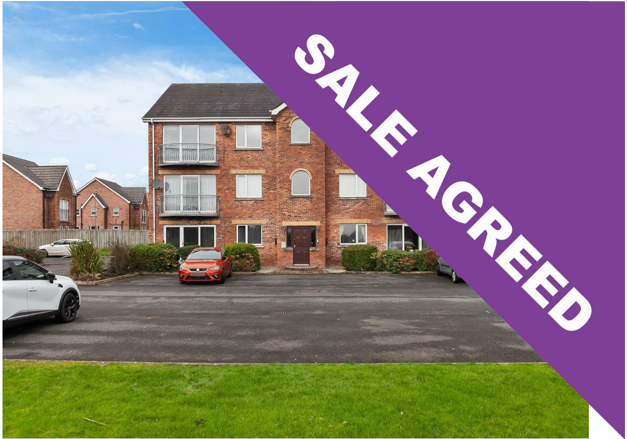
17 Railway Halt, Newtownabbey, BT37 0FJ